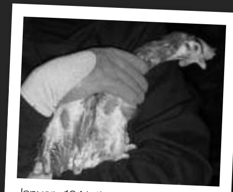
January 19 Netherlands - 52 CHICKENS RESCUED FROM NIGHTMARE