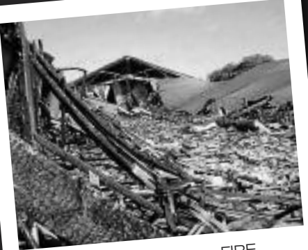
December 12 Germany - FIRE DESTROYS FACTORY FARM UNDER CONSTRUCTION

December 1 Russia - ALF TARGETS VEHICLES IN HUNTING RESORT