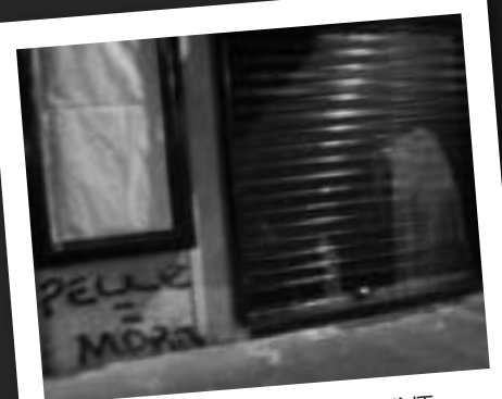
November 26 Italy - RED PAINT THROWN ON FUR SHOP, WINDOWS SMASHED