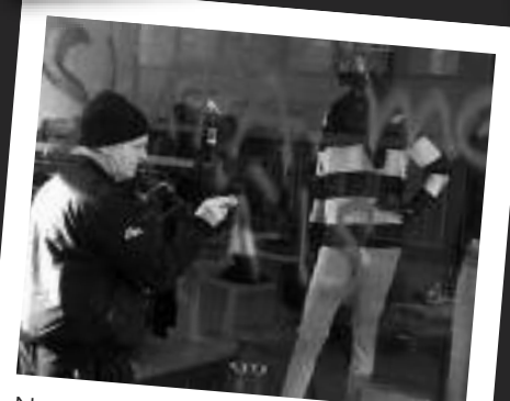
November 27 Sweden - STORE STOPS SELLING FUR AFTER SLOGANS SPRAYPAINTED