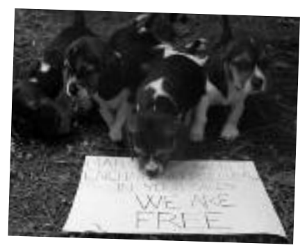
April 30 Italy - PROTEST GOES VERY WELL; 30 BEAGLES RESCUED