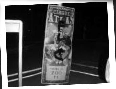
January 25 France - CIRCUS POSTERS DEFACED

January 6 Sweden - SLOGANS PAINTED AT FUR SELLERS