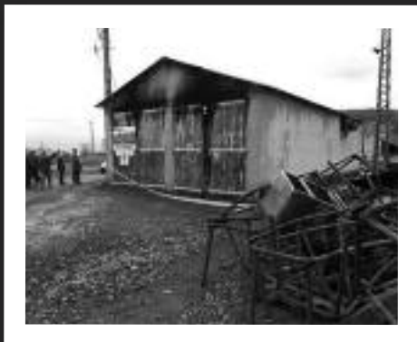
April 16 France - FIRE DESTROYS HUNTING CLUB

April 17 UK - ZIPPOS ANIMAL CIRCUS PROPERTY ATTACKED