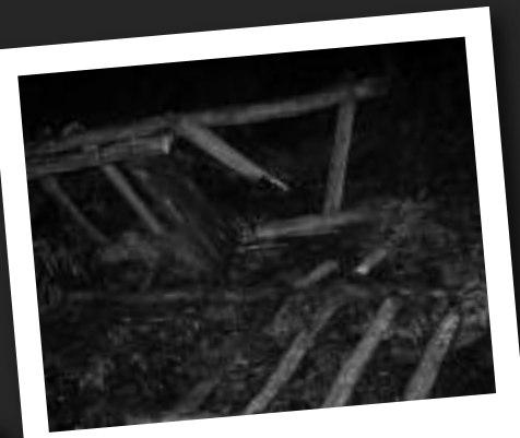
January 7 France -HUNTING SEATS DESTROYED

January 4 Czech Republic -CHRISTMAS EVE VISIT TO PIG FARM