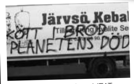
December 28 Sweden - MEAT TRUCK SABOTAGED