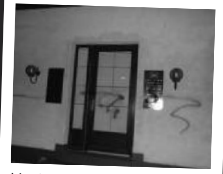
March 20 Czech Republic - FUR SHOP PAINTED