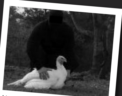
November 24 USA -16 TURKEYS, 2 GEESE RESCUED IN VERMONT