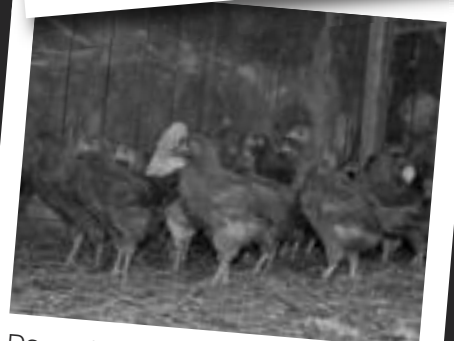
December 15 Italy -46 HENS RESCUED BY ALF