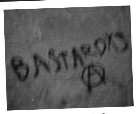
January 8 Spain - SLOGANS PAINTED ON BULLRING