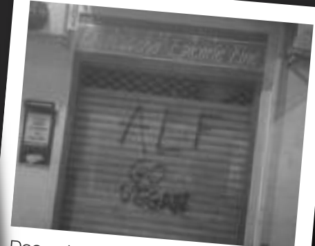
December 26 France - BUTCHER SHOP PAINTED WITH SLOGANS