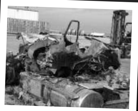
January 9 USA - 14 CATTLE TRUCKS GO UP IN FLAMES