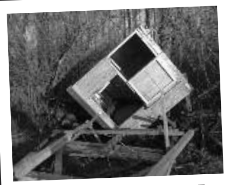
April 12 USA - HUNTING CENTRE DEMOLISHED