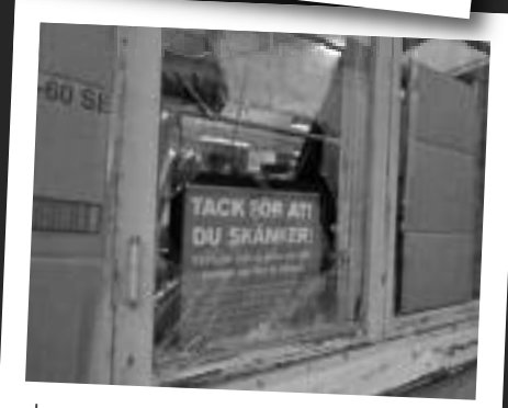
January 13 Sweden - 7 WINDOWS SMASHED AT STORE SELLING FUR

January 4 Italy - HUNTERS' CARS VANDALIZED