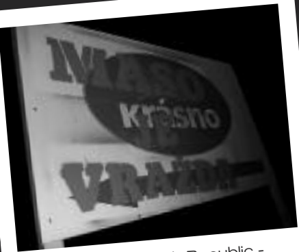
November 30 Czech Republic -SLOGANS PAINTED AT PIG FARM -FIGHT SPECIESISM, GO VEGAN!

November 25 Czech Republic - MEAT ADVERTISEMENTS PAINTED WITH SLOGANS