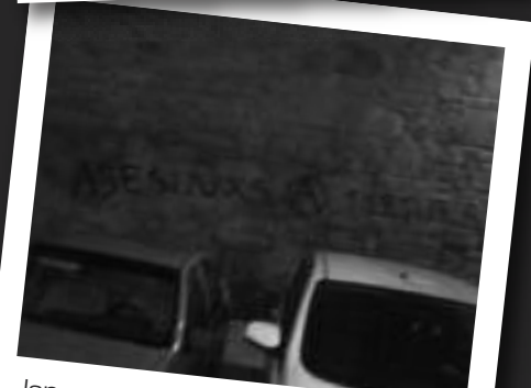
January 8 Spain - SLOGANS PAINTED ON BULLRING