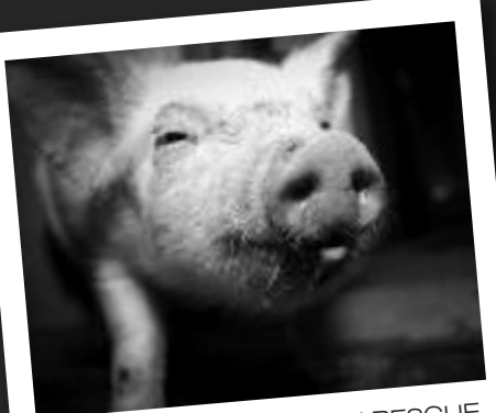
December 8 Chile - OPEN RESCUE OF TWO PIGS

December 1 USA - PAINT ATTACK AT STORE SELLING DEAD ANIMAL "CURIOSITIES"