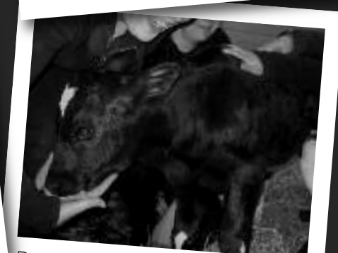
December 6 New Zealand -ACTIVISTS RESCUE CALF, PIGLETS AND HENS