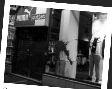
December 2 Greece - STORE VANDALISED TO PROTEST ZOO SPONSORSHIP