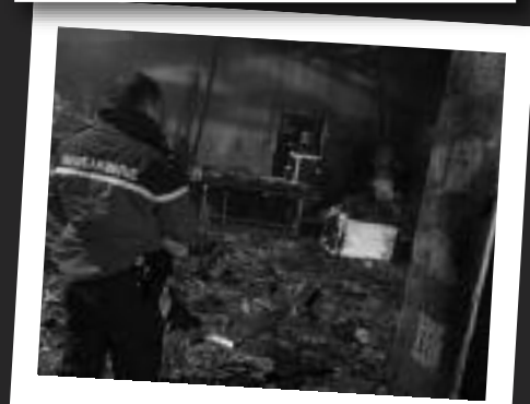
April 16 France - FIRE DESTROYS HUNTING CLUB