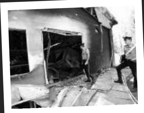
March 12 Italy - CHICKENS RESCUED, RESEARCH FARM DESTROYED (DELAYED REPORT)

March 13 Australia - EQUIPMENT DAMAGED AT EGG FACTORY FARM