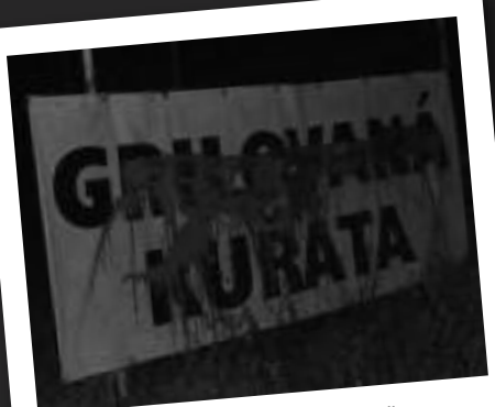
December 15 Czech Republic -MEAT ADVERTISEMENTS PAINTED RED