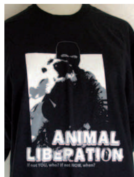
T-shirt - £10 inc postage (sizes S, M, L & XL)