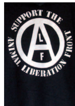
T-shirt - £10 inc postage Hoody - £20 inc postage (sizes S, M, L & XL)