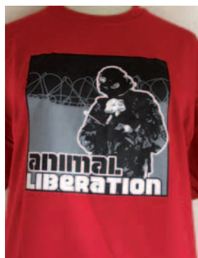
T-shirt - £10 inc postage (sizes S, M, L & XL)