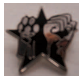
Fist and paw badge in black/chrome

Please complete order form and send it to the address on right >>