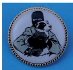
Activist & liberated dog badge - gilt/ black/white