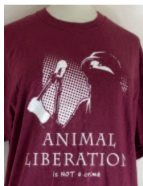
T-shirt - £10 inc postage (sizes S, M, L & XL)