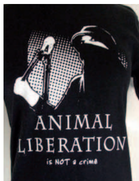
T-shirt - £10 inc postage (sizes S, M, L & XL)