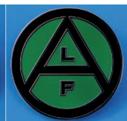
Classic circle ALF badge - available in 5 colours: black/white, black/ chrome, black/red, black/purple and black/ green. The badges are all quality enamel badges with proper pin fixings and are only £2.50 inc postage.

SG order form - (for overseas orders, please email us first: info@alfsg.org.uk )