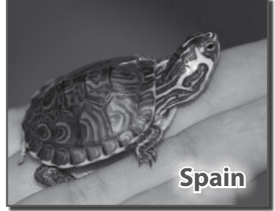
A turtle was rescued from a pet shop and called Walter, after Walter Bond.