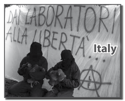
Agriculture research building raided and chickens were freed & taken to safety.