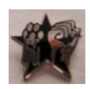
Fist and paw badge in black/chrome

Please complete order form and send it to the address on right >>