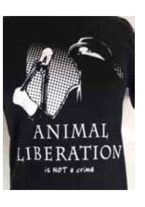
T-shirt - £10 inc postage (sizes S, M, L & XL)