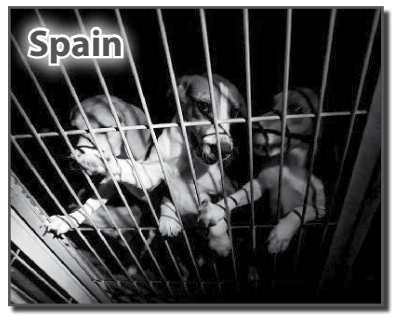
36 beagles were liberated from Harlan breeding facility. (Also back cover picture).