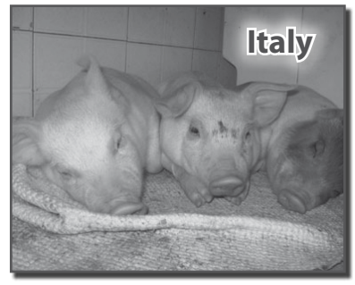
3 piglets were given their freedom away from the suffering and trauma.