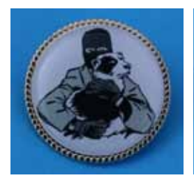
Activist & liberated dog badge - gilt/black/white