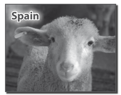
Two lambs rescued from a life of exploitation and certain death.