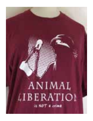
T-shirt - £10 inc postage (sizes S, M, L & XL)