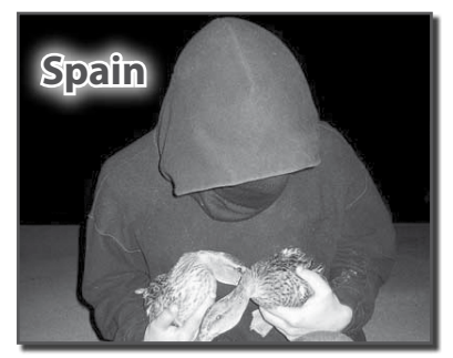
Two ducks are liberated from the boredom and capitivity of the circus.