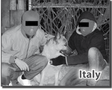
Neglected dog with electric shock collar rescued from cruel 'owner'.