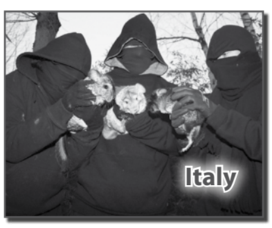
53 Chinchillas were liberated from a fur farm shed to start a new life...