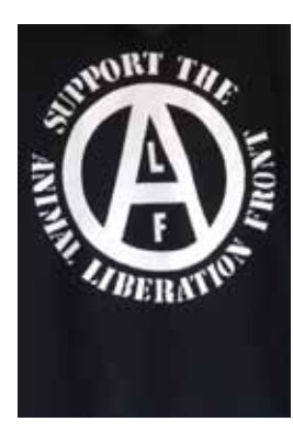
T-shirt - £10 inc postage Hoody - £20 inc postage (sizes S, M, L & XL)