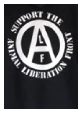
T-shirt - £10 inc postage Hoody - £20 inc postage (sizes S, M, L & XL)

T-shirt - £10 inc postage (sizes S, M, L & XL)