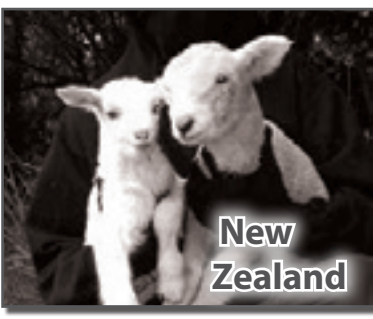
A lamb and a goat liberated from their fate before going to a slaughter house.