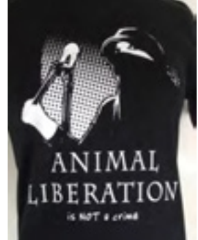
T-shirt - £10 inc postage (sizes S, M, L & XL)