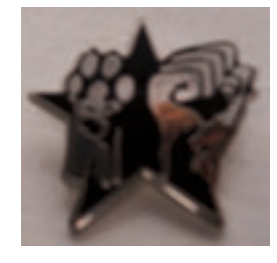
Fist and paw badge in black/chrome