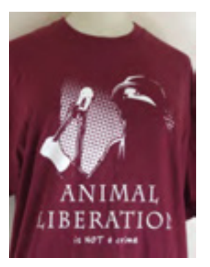
T-shirt - £10 inc postage (sizes S, M, L & XL)