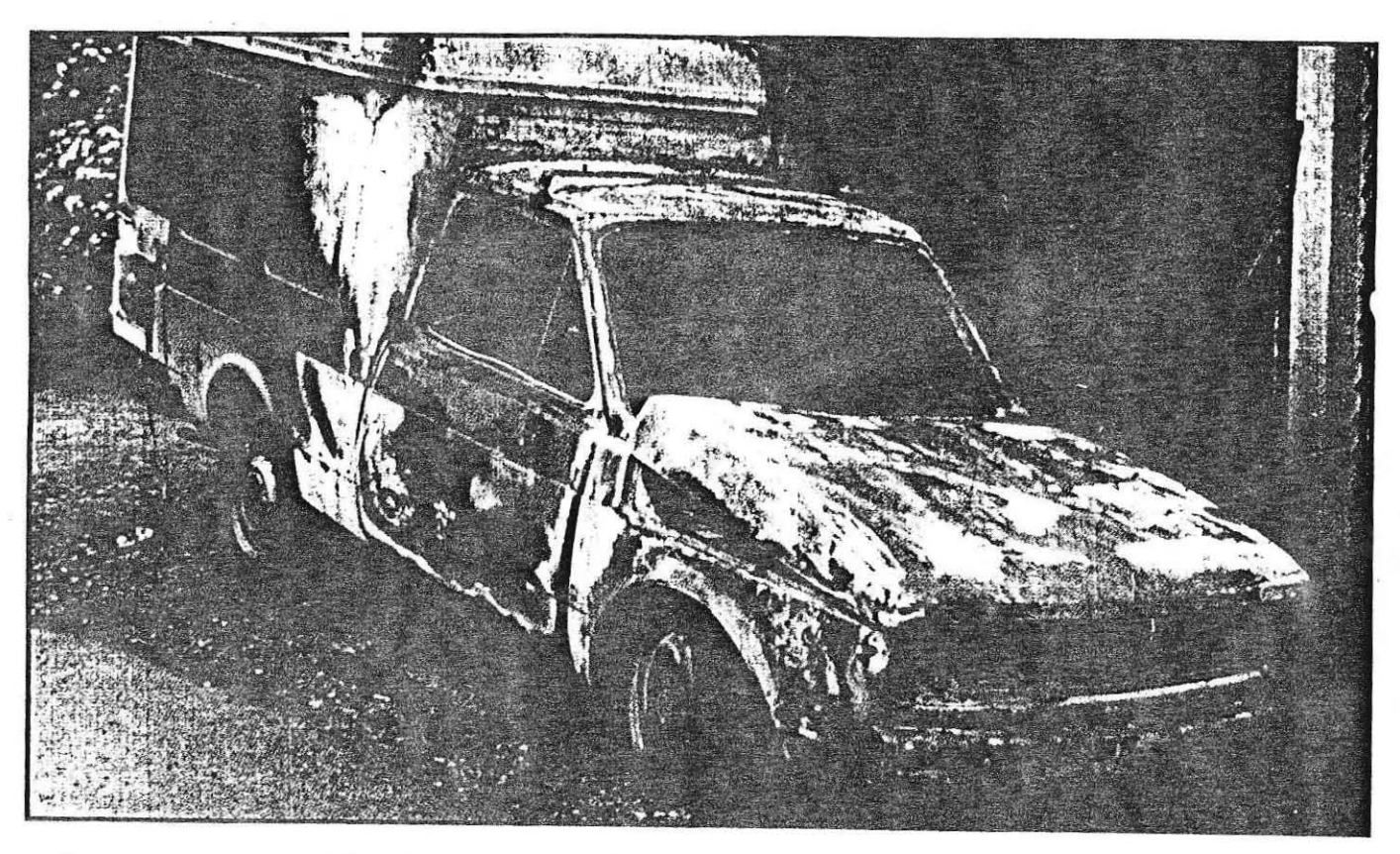
Just two years old - this van was destroyed by the ALF.

This months action picture is taken from the front cover of the "Shooting News", a weekly publication for those whose sick pleasure is derived from murdering birds and animals with guns.